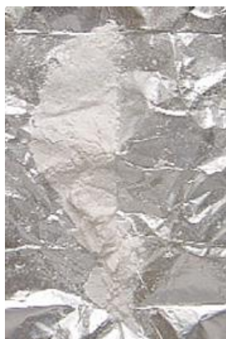
Ocfentanil, paracetamol and caffeine