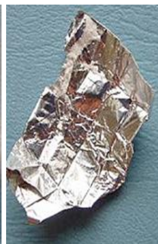
Ocfentanil, paracetamol, caffeine, and methamphetamine