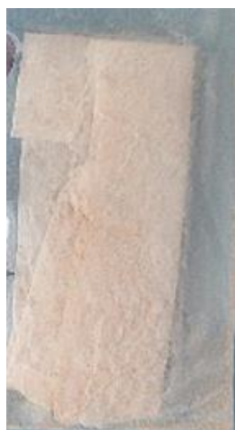
Ocfentanil, paracetamol, caffeine, and mannitol